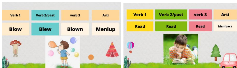
Figure 1. Vocabulary card created by the teacher using canva.com