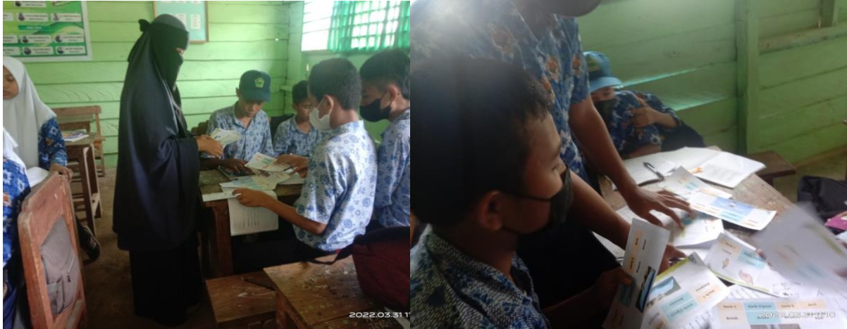
Figure 2. Picture Card Implementation in Classroom