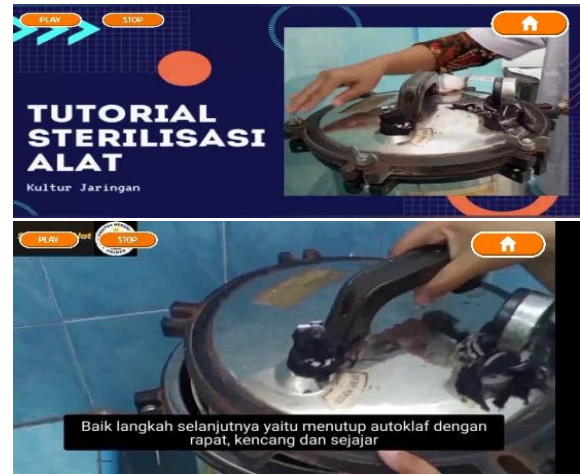
Figure 6. Scene Video.

Based on Figure 5 it can be seen that the image is a Material Menu containing subtitles of materials that can be read by the user as a learning resource.