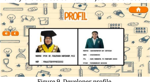
Figure 9. Developer profile.

Based on Figure 8 it can be seen that the Reference Menu is a menu that contains sources of quotations presented in the material scene, namely the sources come from journals or books.