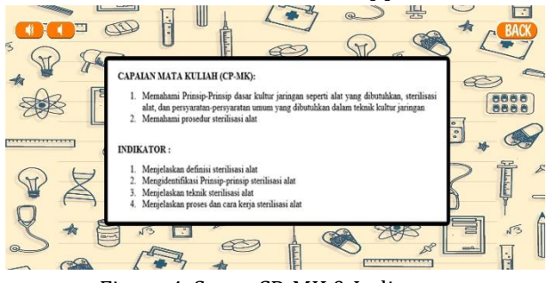
Figure 4. Scene CP-MK & Indicator.

Based on Figure 3, it can be seen that the image is a Instruction Menu that provides an explanation of the instructions for using each button or menu available in the application.