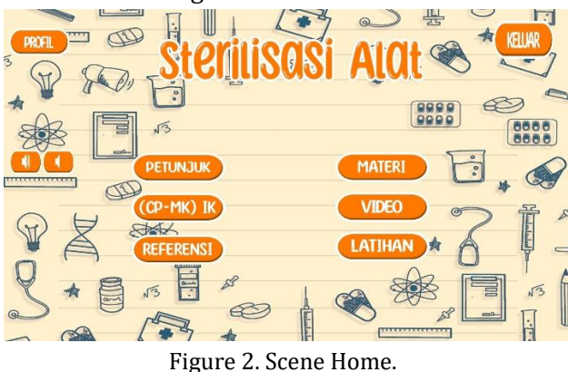
Based on Figure 2 it can be seen that the image is the Home section of the application, where in this scene there are 10 buttons namely:

In the design stage, the results of the learning media that have been designed are obtained. The contents of this learning media are developer profile, audio button on/off Instructions for use, course achievements and indicators, references, material on sterilization of tools, direct video shoot of instrument sterilization procedures, exercises and exit buttons. The design of learning media products can be seen in Figure 2-10.