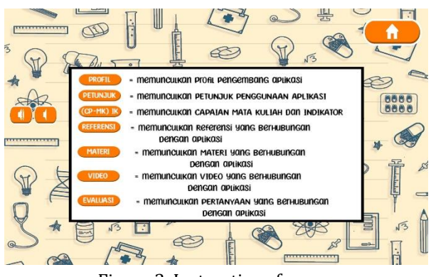
Figure 3. Instructions for use.

Profile, Audio off/on, Instructions, CP-MK, Reference, Material, Video, Exercise and Exit.