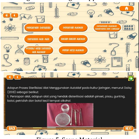
Figure 5. Scene Material.

Based on Figure 4, it can be seen that the image is a Course Achievement Menu and Indicators, namely presenting things that users need to know about course achievements that users will get when using the application.