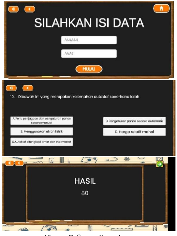
Figure 7. Scene Exercises.

Based on Figure 6, it can be seen that the figure is a video menu that presents tutorials on sterilizing tools in tissue culture.